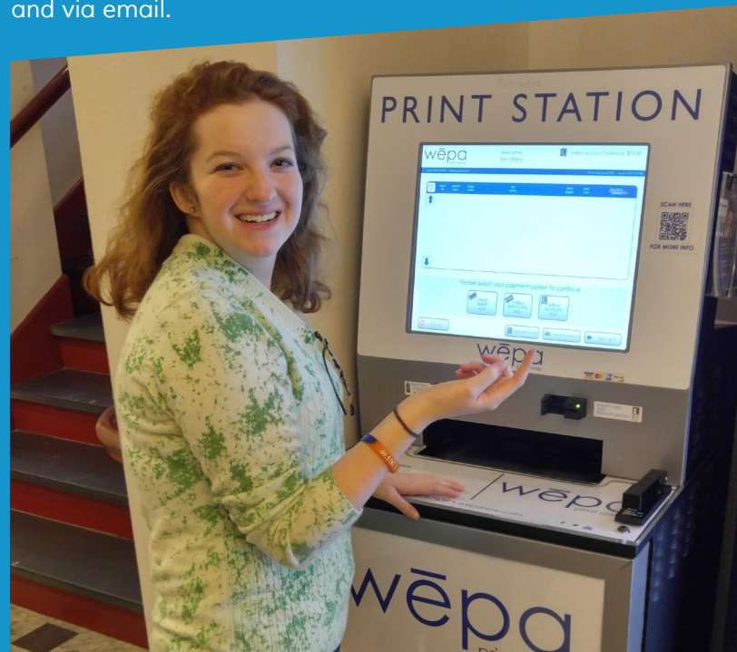
Modernizing student printing

As a fully managed print service that handles any necessary repairs, Wēpa allows students to print from their devices, their favorite cloud storage system, and via email.