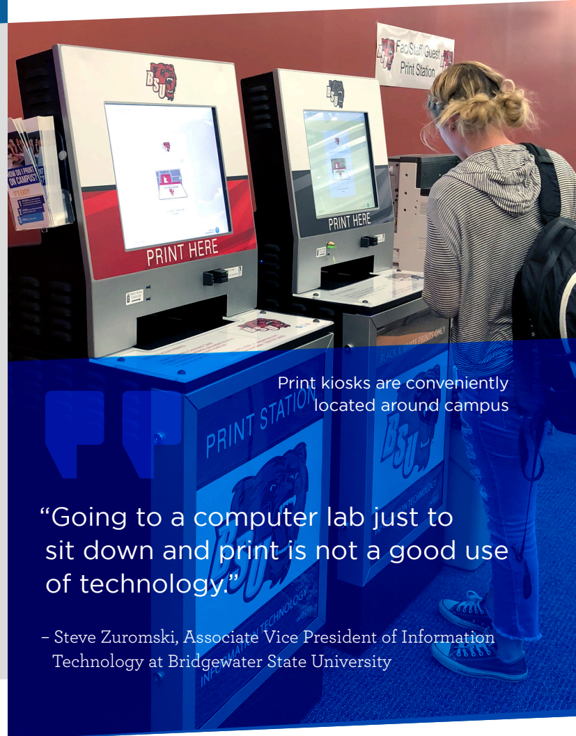
Print kiosks are conveniently located around campus

While residence halls featured Wēpa print kiosks, all BSU student centers, libraries and computer labs relied on a legacy solution that didn't offer wireless printing. BSU students faced a common problem at college campuses. They needed to come into a computer lab, sit at a workstation, login, load the document and print. Not only that, but the original printing solution was also a challenge itself. "It wasn't a user-friendly product. We could see that the students were struggling with it," says Zuromski. There were administrative challenges as well, as the fiscal office needed to track and bill student printing.